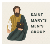
SAINT MARY'S MEN'S GROUP

The Knights of Columbus Council #5429 is reminding all members that our monthly meeting will be Sunday, January 7th at 7:00 p.m. in the Parish Conference Room (located in the Parish Office).